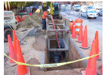
Bailey Contracting at work on NCSU NE Chilled Water Project

Bailey Contracting, Inc. is a local utilities and excavation contractor serving the Triangle and surrounding areas since 1970. Our company offers a variety of services which includes but are not limited to the following: land development, general contracting, concrete forming, pouring and installation, plumbing, backflow installation, highway construction, small site excavation, and utilities: water and sewer (our specialty). Our operation is an experienced turnkey contractor holding multiple state and local licenses. We look forward to bidding future turnkey projects, while focusing on site utilities.