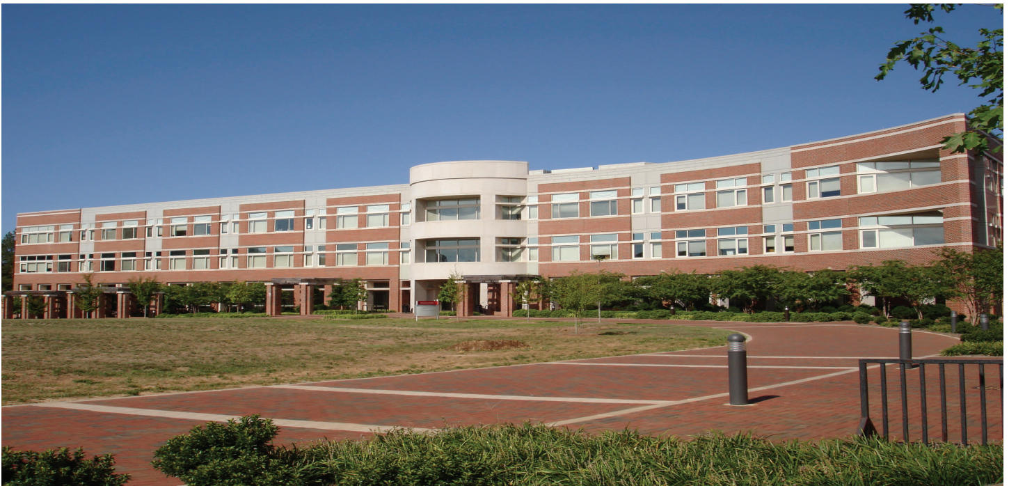
College of Engineering Complex— Phase I GSF 161,217 Cost $34,819,671 Designer: Perkins & Will Architects Contractor: Shelco, Inc. MBE Participation: 18.1%