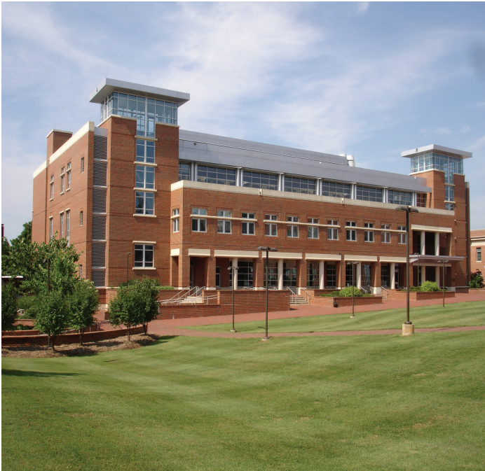
Marye Anne Fox Science Teaching Lab GSF 116,521 Cost $26,566,804 Designer: Little & Associates Contractor: RN Rouse & Co. MBE Participation: 14.9%