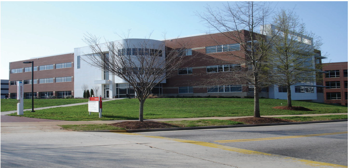
Partners III GSF 82,988 Cost $22,320,211 Designer: Freelon Group Contractor: Shelco, Inc. MBE Participation: 26.8%