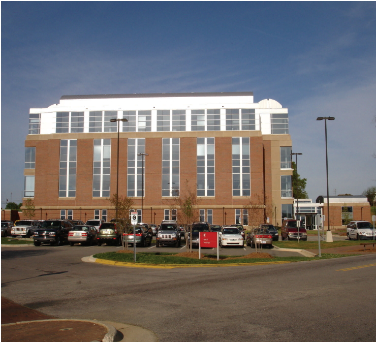
College of Veterinary Medicine Research Lab Building GSF 103,000 Cost $32,936,188 Designer: Flad & Associates Contractor: Bovis Lend Lease MBE Participation: 17.8%