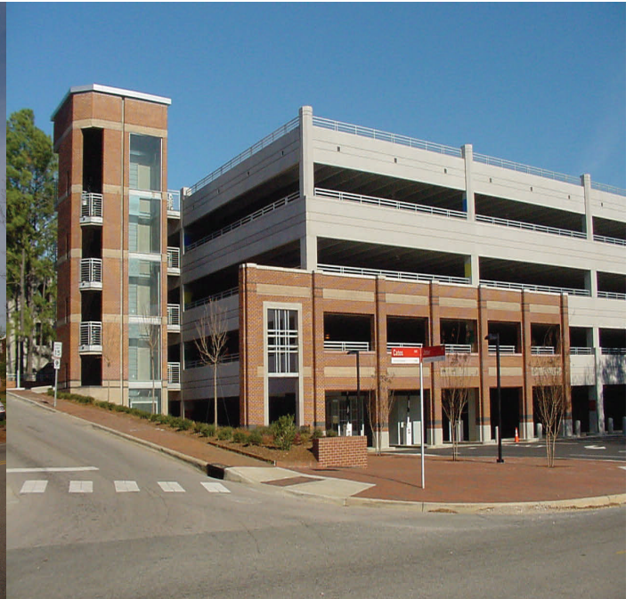
Coliseum Parking Deck Expansion Spaces 865 Cost $8,262,777 Designer: Kimley Horn and Associates Contractor: DH Griffin Construction Co. MBE Participation: 9.0%