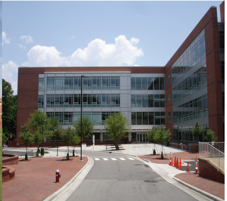
SAS Hall GSF 123,152 Cost $31,305,160 Designer: Millennium 3 Design Group Contractor: Clancy & Theys Construction MBE participation: 18.1%