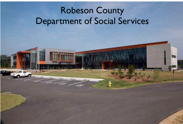
Robeson County Department of Social Services

Construction of a 20,000 square foot Administrative building that combines all services of the Lumbee Tribe. The building is shape like a "Turtle". The Tribal Leaders wanted a building that would serve as a landmark for future generations. The "Turtle" structure will help preserve our culture, it is also the Native American symbol of Power, Strength and Longevity.