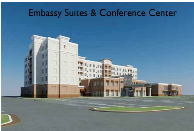
Embassy Suites & Conference Center

105,000 square foot of Social Services Complex consisting of a Juvenile Court and a training room with 400 seats and is used for all Robeson County administrative trainings. The project consisted of three separate wings connected by curtain walls and steel bridge. The building is constructed out of structured steel, brick veneer with a standing seam metal roof. Designed to achieve LEED silver status by U.S.G.B.C. CM Project with full Pre-construction services.