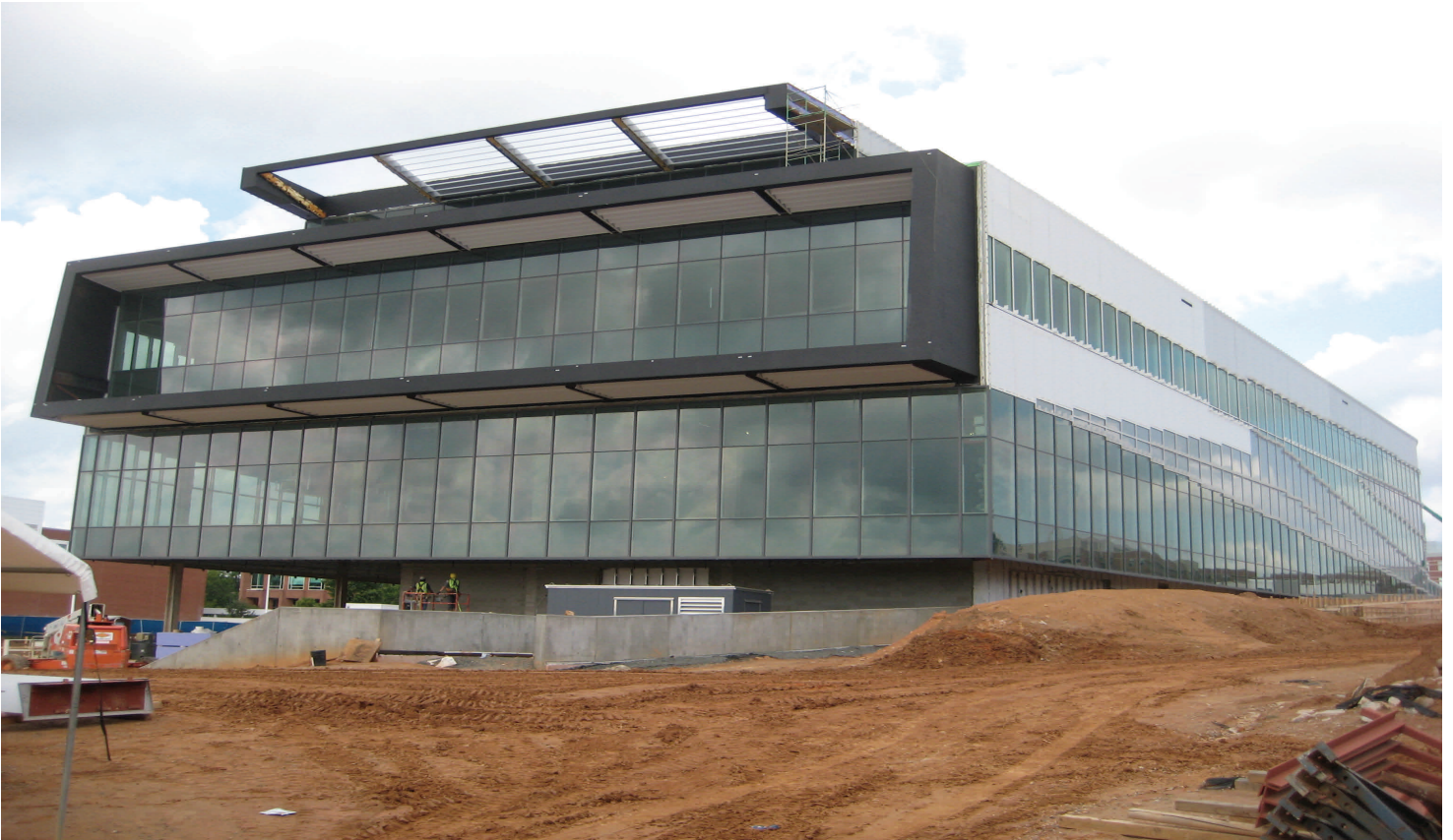
James B. Hunt Jr. Library under construction 25% overall minority business participation