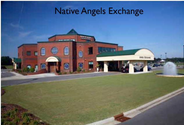
Native Angels Exchange