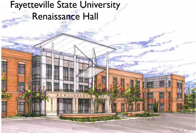
Fayetteville State University Renaissance Hall

Constructed using pre-engineered steel and structure with metal stud curtain walls and brick and split faced cmu veneer.