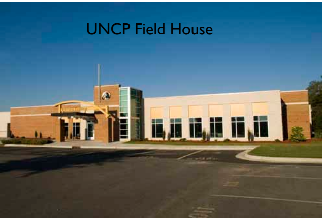
UNCP Field House

Two story steel structure frame with cold form metal framing. TPO roof system, Aluminum composite panels, Curtain walls, Boiler/Chiller, Fire Suppression and Fire Pump.