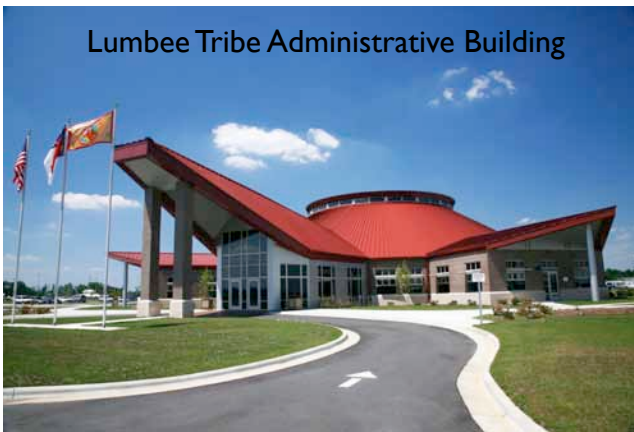
Lumbee Tribe Administrative Building

Angels Exchange was a highly complex octagonal structure with eight radiating wings. It has a square footage of approximately 36,000. The structure massed three stories in height capped with a pyramid skylight @ 62' high. The facility was brick veneer, standing seam metal roof, and aluminum storefront windows. The interior of the building has a three story atrium that is open to the corridors of all three floors above and is served by a elevator or glass railed spiral staircase.