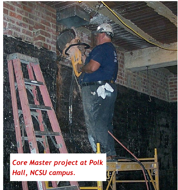
Core Master project at Polk Hall, NCSU campus.

Core Master is a controlled demolition service company providing concrete cutting, sawing and breaking. Core Master provides a variety of services from time and material to contract cutting jobs throughout the States of North and South Carolina.