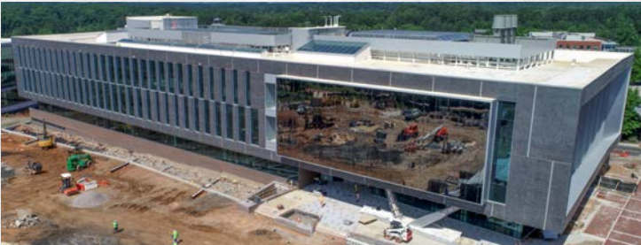
Fitts Woolard Hall - Skanska (HUB - 12.8%)