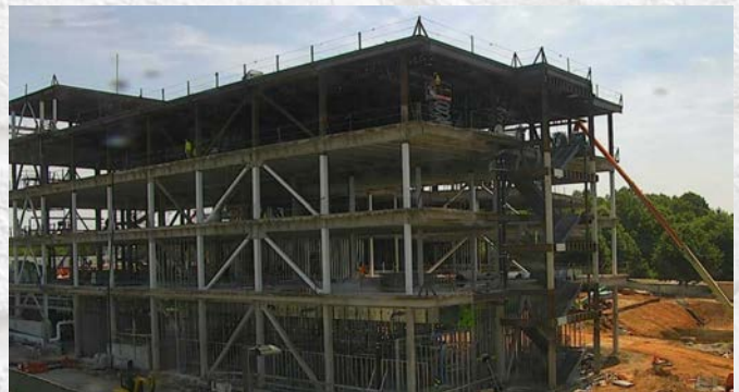
Plant Sciences - DPR Construction - (HUB - 10.5%)