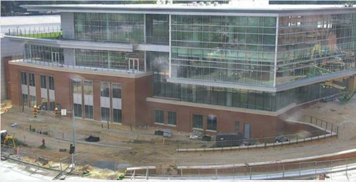
Carmichael Wellness & Recreation Center Frank L Blum Construction (HUB - 13.7%)