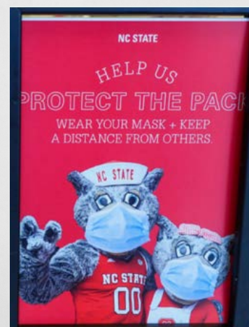
NCSU "Protecting the Pack"

Contacts & CPM HUB Advisory Committee Members - 8