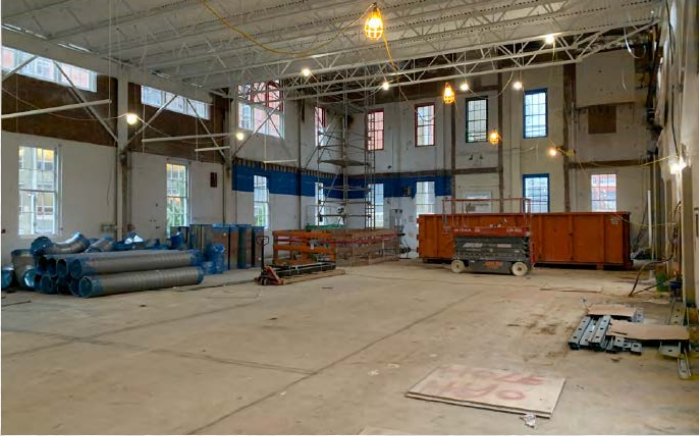
Bureau of Mines - Holt Brothers Construction (HUB - 32.2%)

The NCSU CPM division continues to expand the campus community. Major project development and renovations can be seen on campus. Fitts-Woolard Hall and Plant Sciences are well into construction and moving forward with amazing infrastructure. Bureau of Mines, Carmichael Wellness & Recreation Center, Memorial Belltower Renovation, and Greek Village Phase 4 Infrastructure are in construction with intricate design. Summer projects are on the rise with storm water improvements, sidewalk renovations and underground utility work. General contractors have made good faith efforts to ensure that minority contractors are working on projects. Overall HUB participation for construction and design is 34.7% which exceeds the required goal of 10%. While the campus is expanding, safety measures have been implemented to prevent the spread of the virus that causes COVID-19.