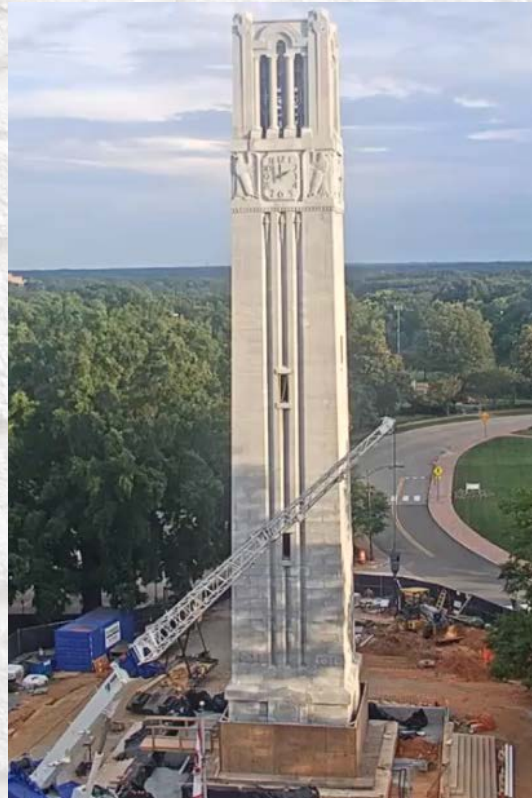
Restoration of Memorial Belltower-New Atlantic (HUB 13.8%)