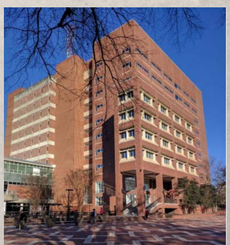
Academic Success Center DH Hill Library Holder Construction, HUB- 16.5%