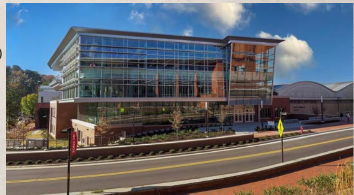
Carmichael Renovation & Expansion - Frank Blum HUB- 13.6%