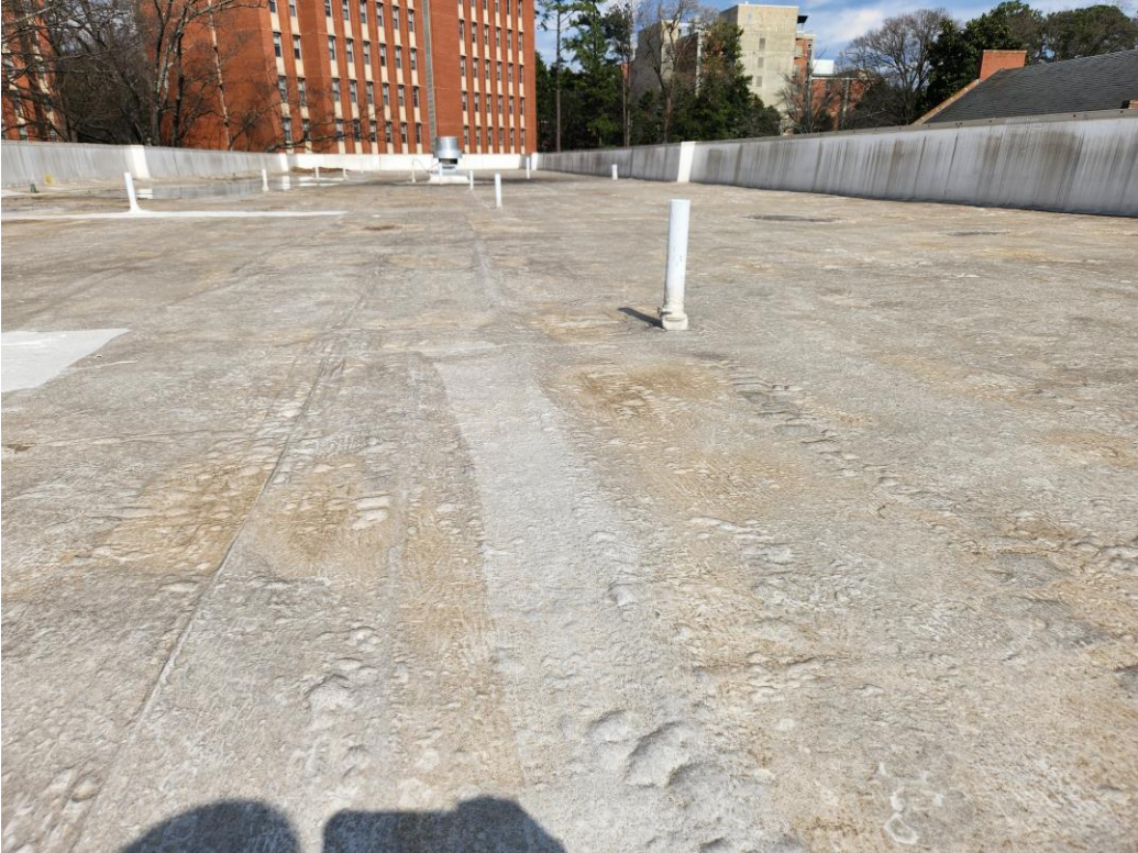
Roof at Owen Residence Hall