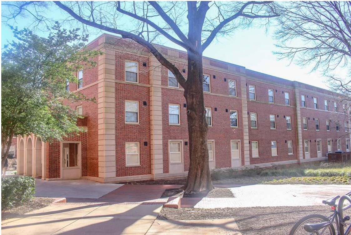
Owen Residence Hall