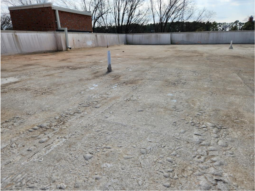
Roof at Owen Residence Hall